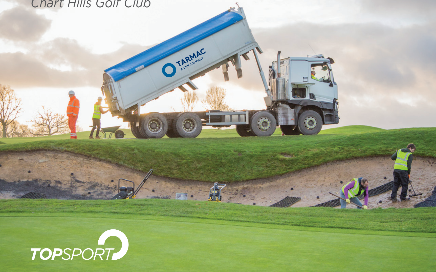
Chart Hills Golf Club